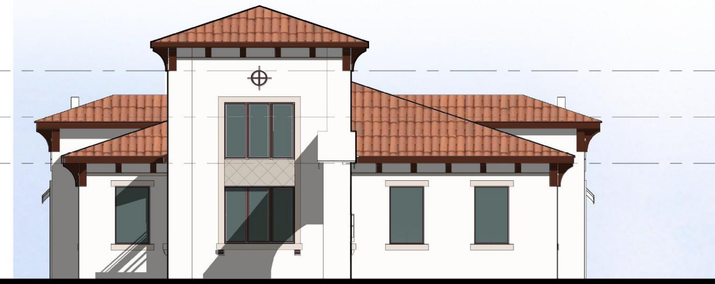
3. ELEVATION 3 1/8" = 1'-0"