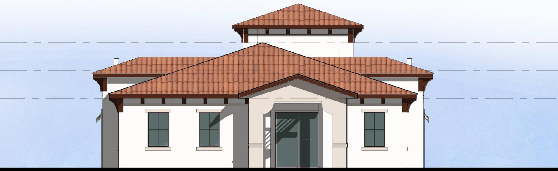
4. ELEVATION 4 1/8" = 1'-0"