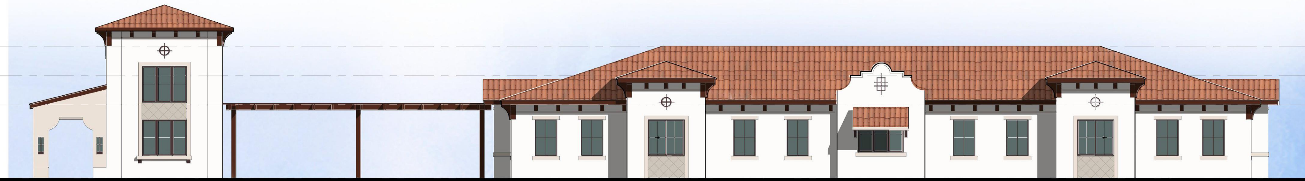
1. ELEVATION 1 1/8" = 1'-0"