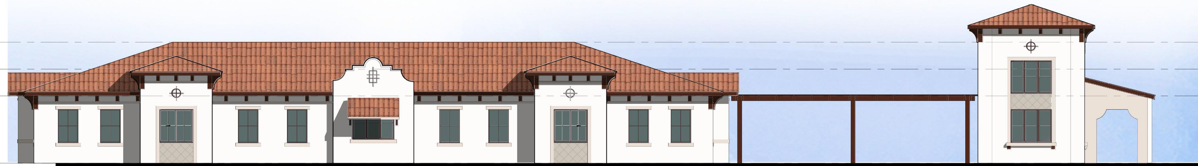
2. ELEVATION 2 1/8" = 1'-0"